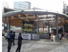
Creation of cool areas (Dry mist cooling system and heat ray reflection film)