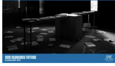
"Culturing < O/Paper>cut" Hideo Iwasaki