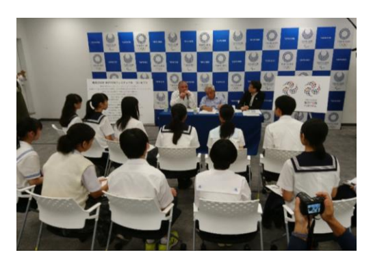
Scene from a Tokyo 2020 NIPPON Festival press conference held on July 2, 2018 (Mon.)

Junior and senior high school students around the country visited the Tokyo 2020 Cultural Olympiad programme and various other festivals, events and cultural assets in Japan themed on local history and culture. The students acted as journalists and gained information and knowledge, which they summarised in their own newspapers, reports and video news to share the charm of the local culture in their communities.