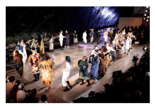
Tokyo Caravan in Hokkaido (2019/2020)