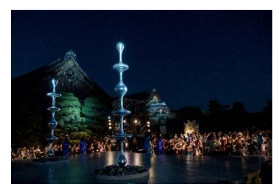
Tokyo Caravan in Kyoto (2017)

Continuous interaction across countries and regions has created a cultural platform beyond the Tokyo 2020 Games.