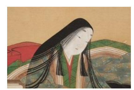
Japan 2019 Official Programme The Tale of Genji: A Japanese Classic Illuminated Tosa Mitsuoki. Portrait-Icon of Murasaki Shikibu (detail). 17th century. Ishiyamadera Temple.