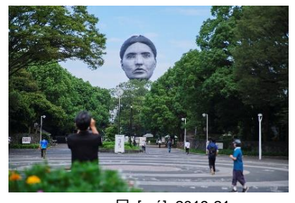
masayume, 目 [mé], 2019-21

It is a work created in Tokyo by the contemporary art team \boxminus [m\acute{e}] . The project invited people around the world to submit photos of their faces and then they chose the face of a real person to float up into the sky of Tokyo in 2021. A gigantic face suddenly appeared in the sky of Tokyo. Such a mysterious, astonishing scene surprised many people and gathered attention.