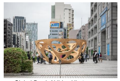
Global Bowl, Akihisa Hirata

It is the first project in the world that proposed a free, new urban landscape by placing pavilions designed by Japanese architects and artists who are active all over the world at multiple locations in Tokyo, mainly around Japan National Stadium. Like a treasure hunt with a map in hand or on a walk, viewers could go around the pavilions where the creators expressed their hopes for the future. This project provided visitors an opportunity to feel the attractions of Tokyo as a city and the beauty of Japanese architecture.