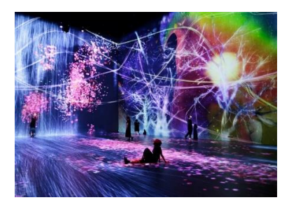
Japonismes 2018 Official Programme teamLab: Au-delà des limites ©teamLab