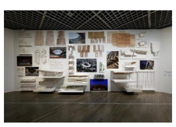
Installation view