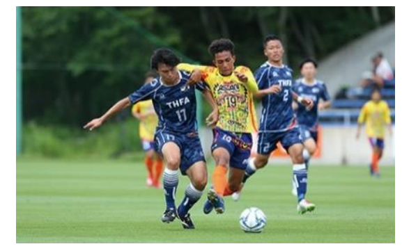
International Friendly Football Match "JapaFunCup" Southeast Asian U-18 「ASIAN ELEVEN」 vs. the U-18 Tohoku Selection Team