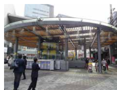
Creation of cool areas (Dry mist cooling system and heat ray reflection film)